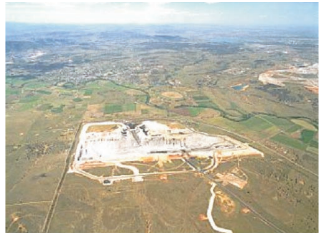
FIG 3 - Bengalla Coal Mine with Muswellbrook township in the background.

Bengalla Mine is managed by Coal and Allied on behalf of Rio Tinto Coal and its partners. It is a low-cost operation in the Hunter Valley producing six million tonnes of coal in 2003 and blasting 19 million bank cubic metres of material. Bengalla is 1.5 km from the township of Muswellbrook and is surrounded by a number of residences as shown in Figure 3. The management of environmental effects including blast induced fumes on its surroundings is of paramount importance to the mine.