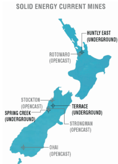
FIG 1 - Location map of SENZ mining operations.

of new generation. This would create an anticipated additional demand for up to 3 Mtpa of coal.